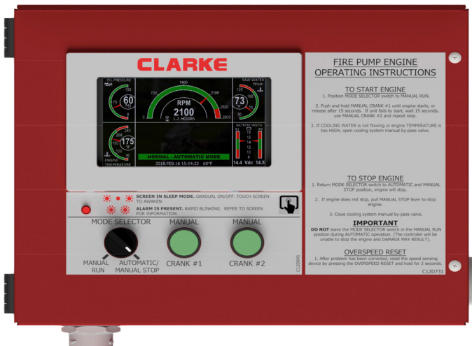
Stainless Steel Option NEMA Type 4X (IP66)