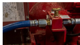
Pressure Limiting Driver