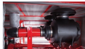
Two Stage Air Cleaners