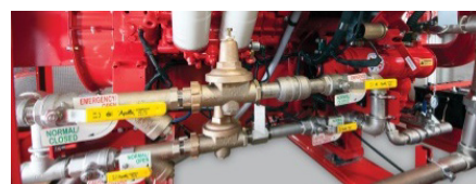
316 SS Cooling Loops