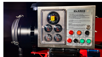
NEMA 4X/IP66 Stainless Steel Instrument Panel

Specifications and information contained in this brochure is subject to change without notice.