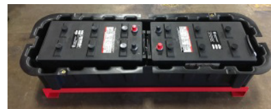
Battery Kit w/ Ship Loose Box