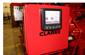
Full Alarm/Gauge Package